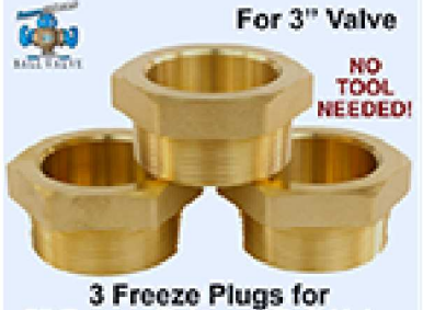
3 Freeze Plugs for 3" Freeze Tolerant Ball Valve