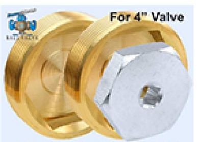
2 Freeze Plugs / 1 Tool for 4" Freeze Tolerant Ball Valve

Three Freeze Plugs for 3 inch Freeze Tolerant Ball Valve. (FTBV)