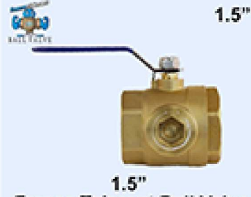
Freeze Tolerant Ball Valve