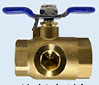
1 inch Industrial with Tee Handle