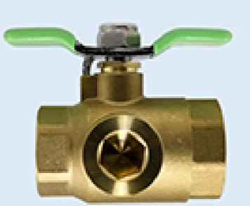
1 inch Lead Free "T" handle

600 WOG (psi) rated. Stainless steel stem and nut, Heavy duty handle.